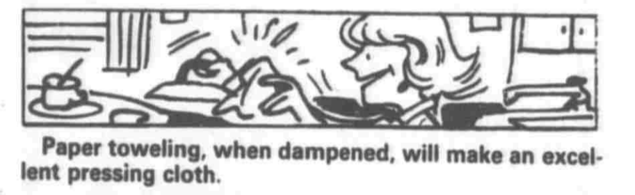
Paper toweling, when dampened, will make an excellent pressing cloth.