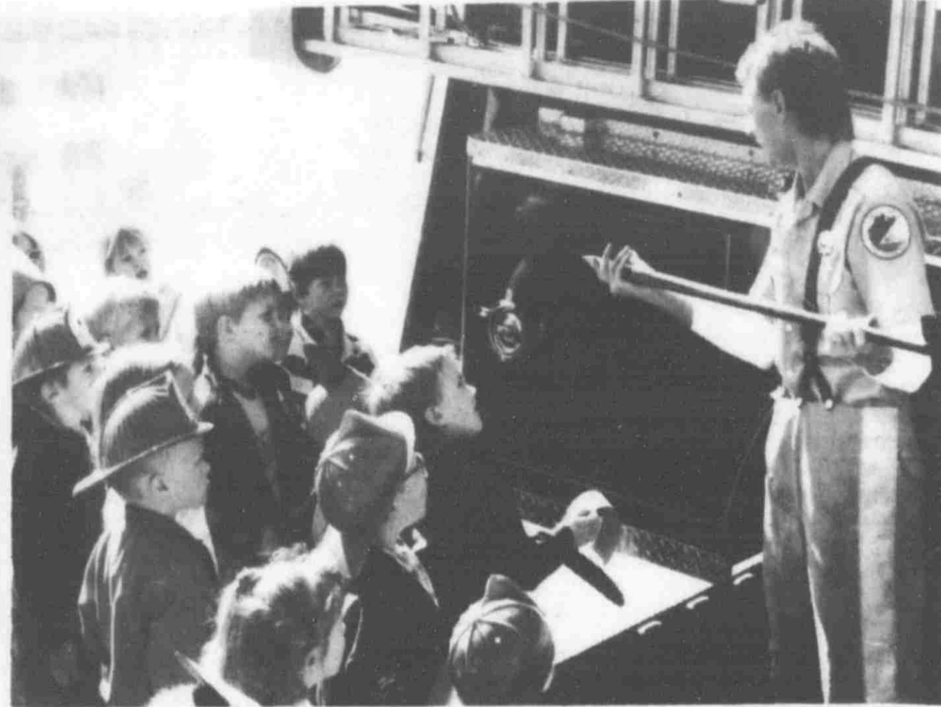
Some Lowell United Methodist pre-schoolers brought their own red hardhats while others made their own.

Lowell Fire Dept. displays equipment to United Methodist Pre-School children