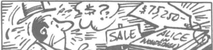
The original manuscript of Lewis Carroll's Alice's Adventures in Wonderland was sold in 1928 for $75,250.