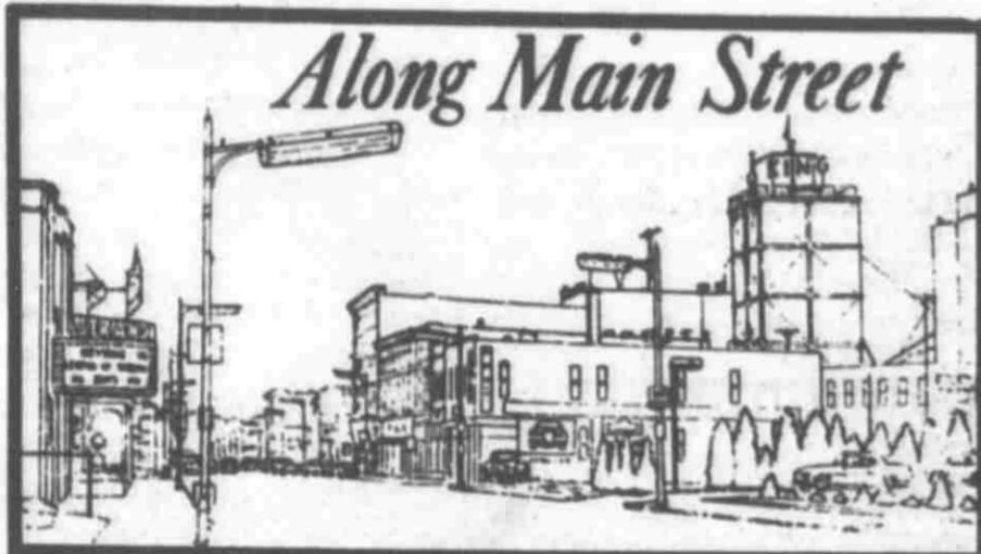
Along Main Street