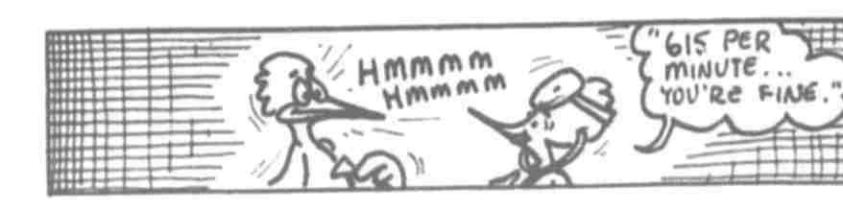
The hummingbird's heart beats 615 times a minute.