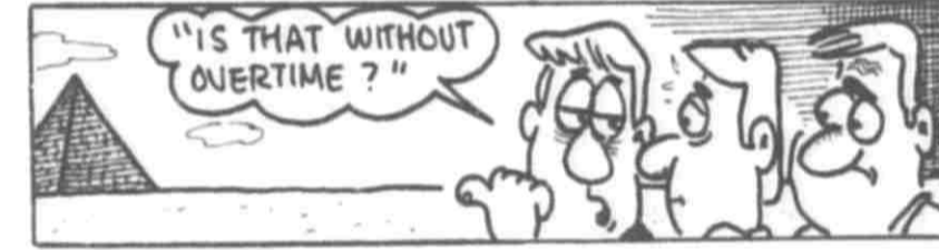
About 100,000 men labored to build a single pyramid in ancient Egypt.