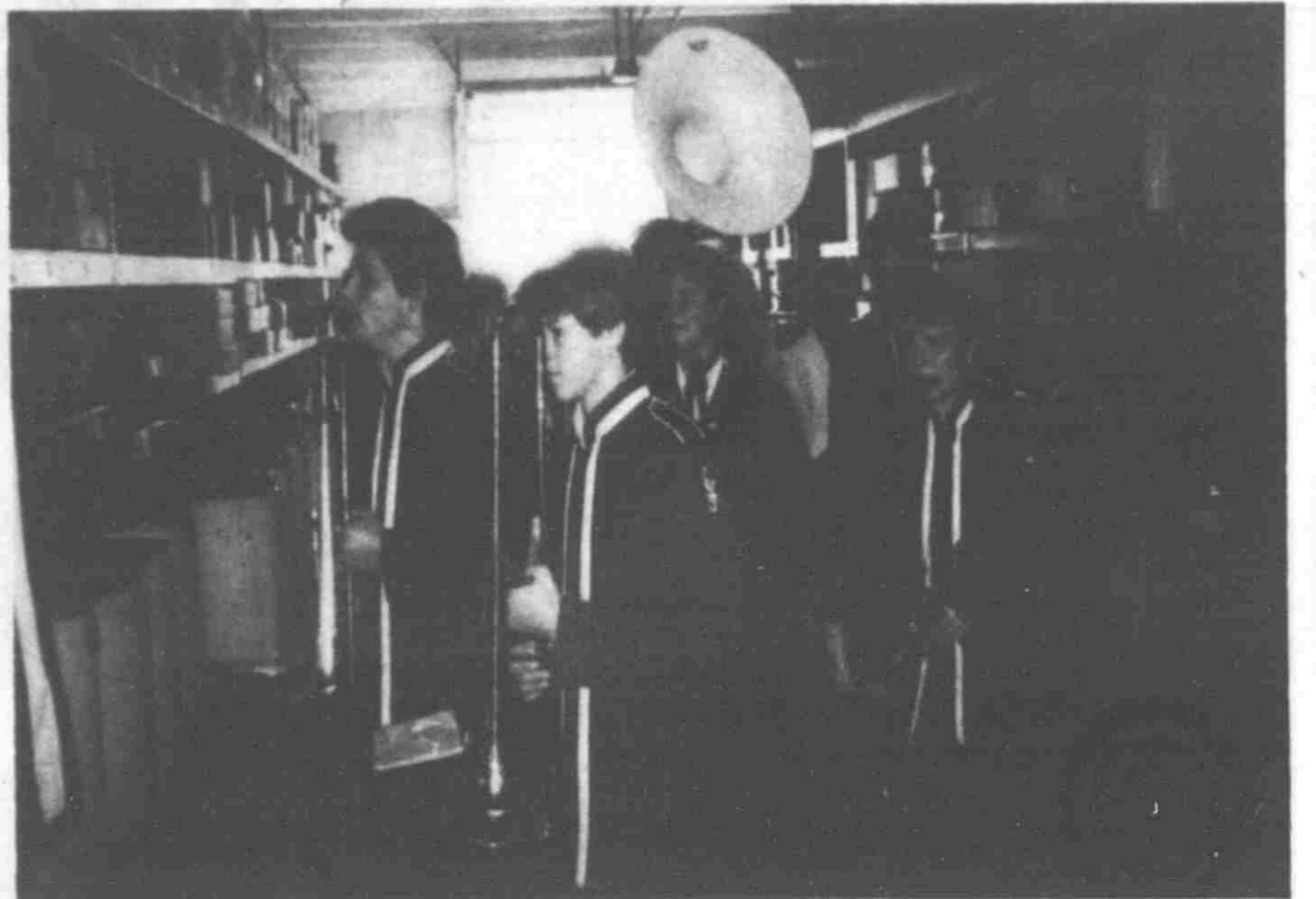
The Lowell Marching Band makes its way through the back entrance of Byrne Electrical Specialists Inc. in preparation for their half-hour concert for the Byrne Electric employees.