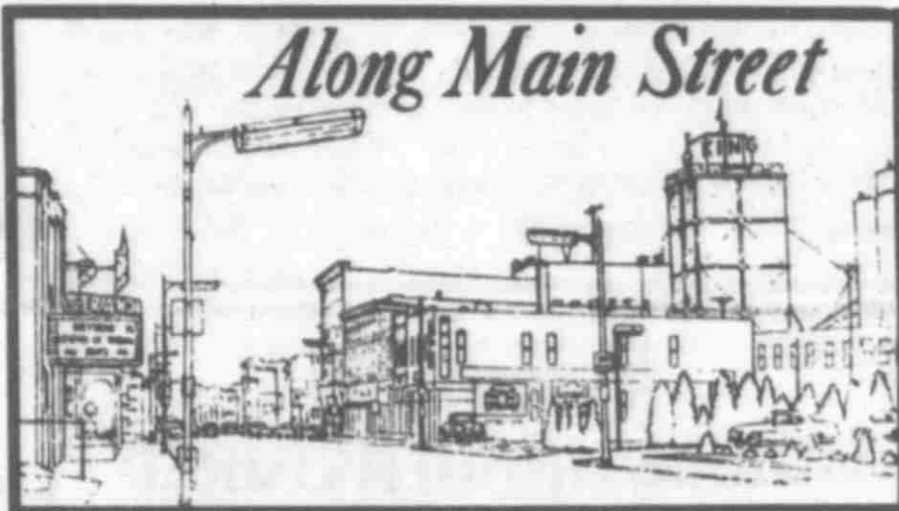
Along Main Street