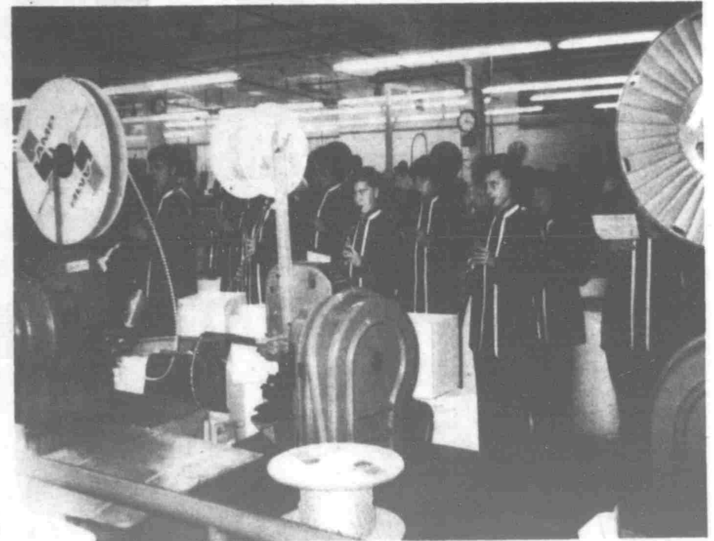
After marching around the plant, playing the Lowell school fight song, the Red Arrow band readies itself for its concert performance.