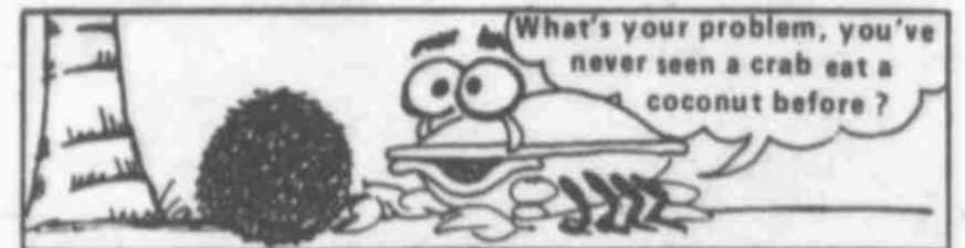
One kind of hermit crab grows more than two feet long. It is called the robber crab and coconut crab because it is said to climb coconut trees and pick the nuts.

Moonlight Madness sponsored sale is successful because people like sales and they're fun.