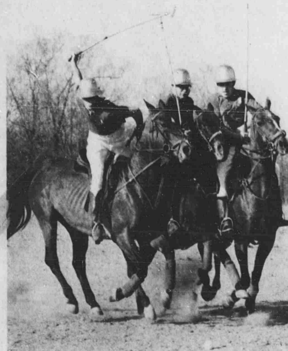
YOUNG POLO ENTHUSIASTS in action at other club members will have a full season of action continuing through September. Included on the schedule is a six-day clinic

All three are rated as excellent horsemen and capable of playing in the best low-goal competition anywhere in the country, according to a club spokesman.