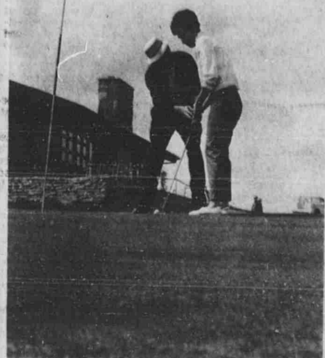
PUTTING ON NO. 7 GREEN AT ARROWHEAD

"The course, opened just 3 years ago this Thursday, took four years of patient... and sometimes exasperating... toil to complete."