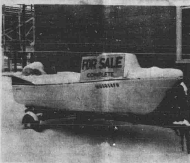
MOTHER NATURE DISPLAYED one of her capricious whims over the weekend when... despite the fact IT WAS SPRING... the Lowell area (and much of the country) was hit by snow and more snow, as these pictures show all too well.