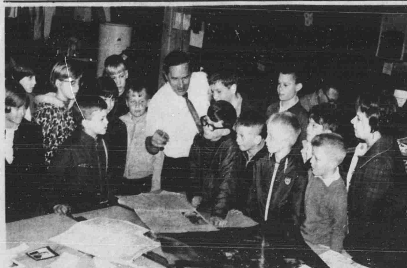
ORCHARD VIEW STUDENTS VISIT LEDGER-SUBURBAN LIFE (See story on page 5)