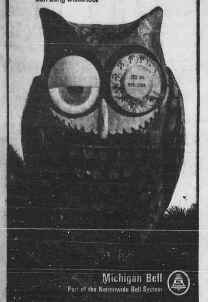
Michigan Bell Part of the Nationwide Bell System

Want to be a wise money-saver? Then try your Long Distance calls direct.