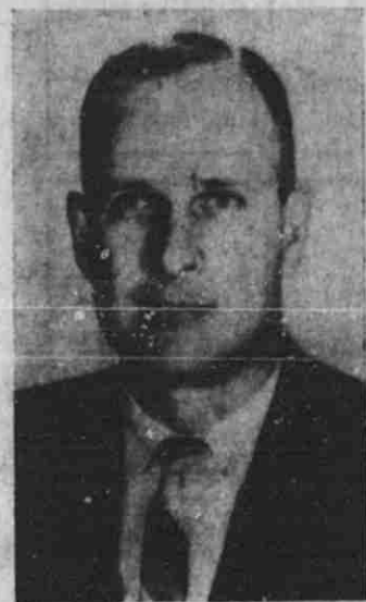
Davenport moved up on Illinois Central

The 14,000 semi-finalists appointed throughout the nation have advanced to the second step in the competition for about 2,900 Merit Scholarships, valued at more than $8 million, to be awarded in 1968. These students constitute less than one percent of the graduating secondary school seniors in the nation.