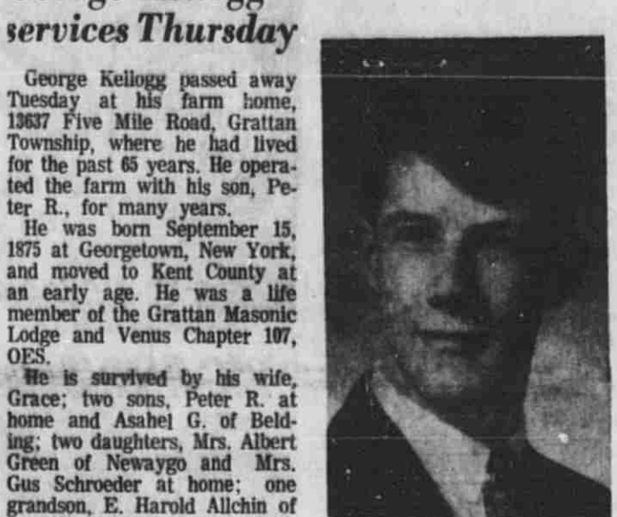
Lowell youth leaves on round-the-world tour

In lieu of flowers the family suggests that donations be made the Dr. Doran Foundation at St. Mary's Hospital or to the American Heart Association.