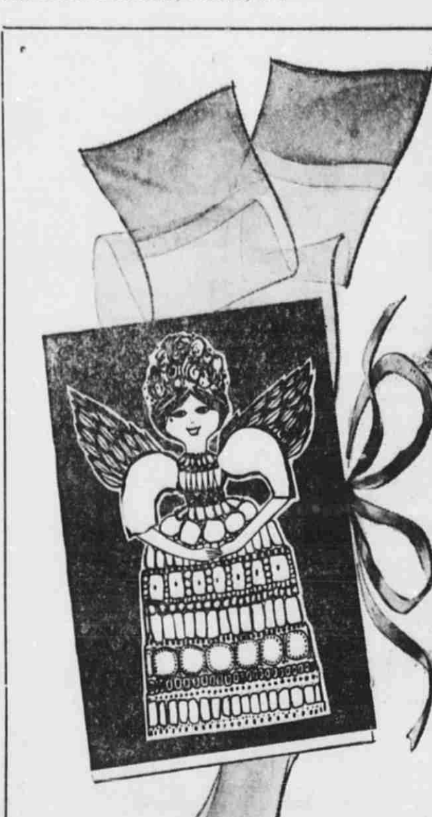
what a heavenly way to give BERKSHIRE stockings