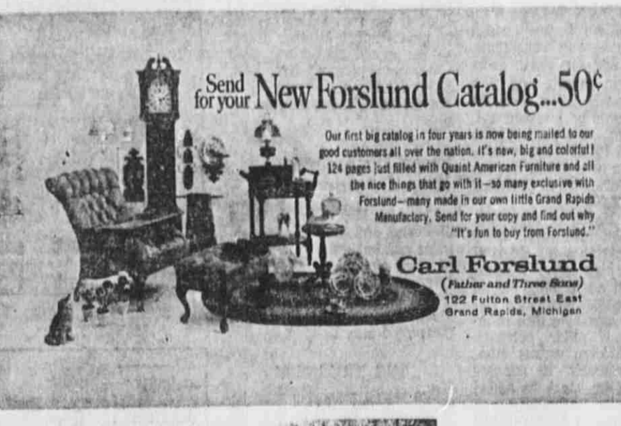
Send for your New Forslund Catalog... 50¢