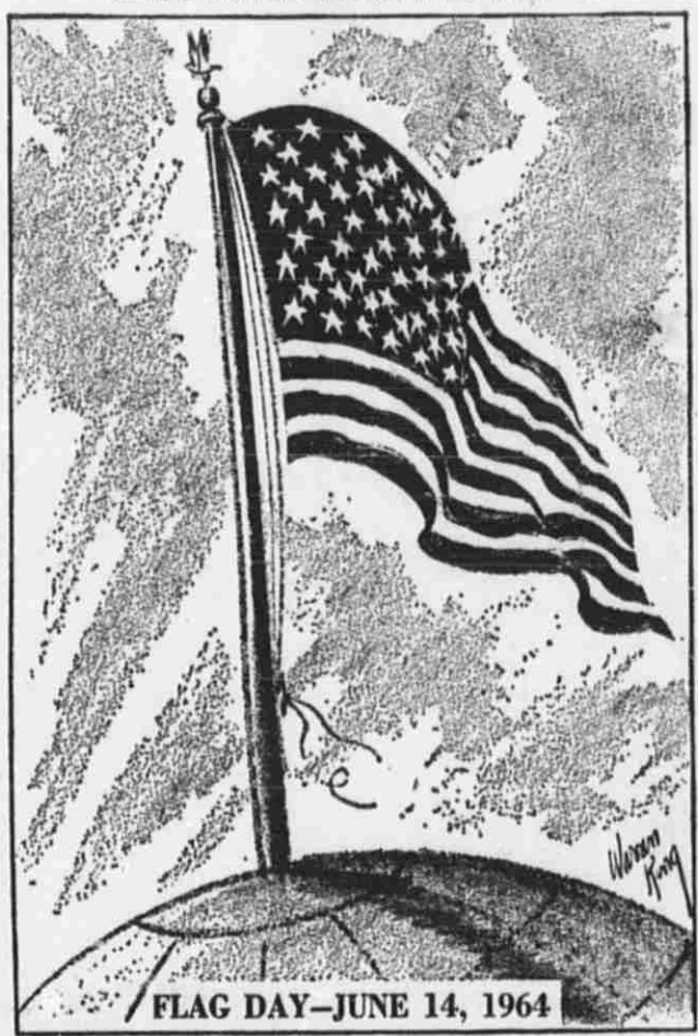
FLAG DAY—JUNE 14, 1964

A THOUGHT FOR FLAG DAY When I think of the flag... I see alternate strips of parchment upon which are written the rights of liberty and justice, and stripes of blood to vindicate those rights and in the corner, a prediction of the blue serene into which every nation may swim which stands for these things.—Woodrow Wilson