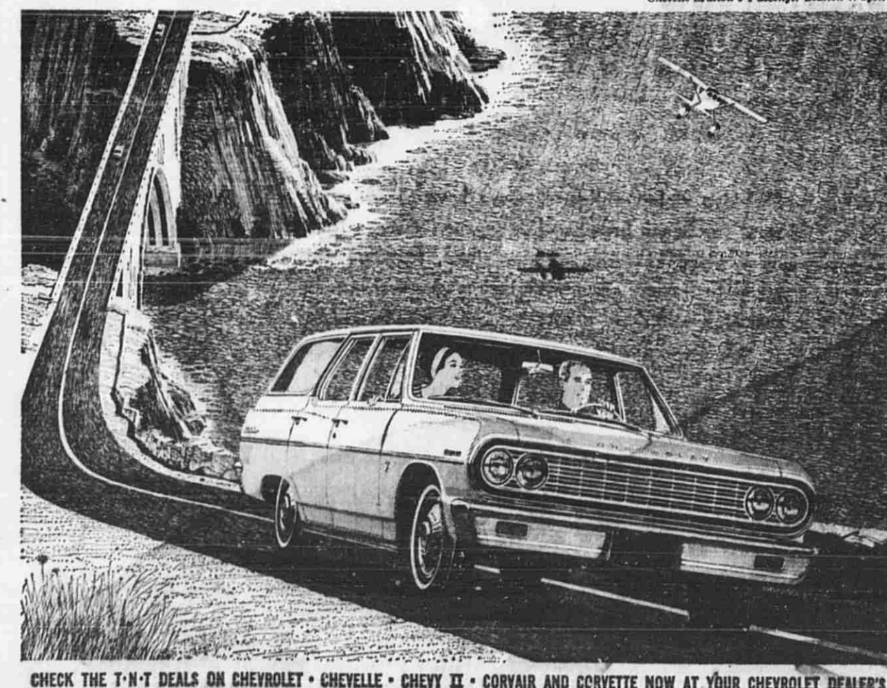
CHECK THE T-N-T DEALS ON CHEVROLET • CHEVELLE • CHEVY II • CORVAIR AND CORVETTE NOW AT YOUR CHEVROLET DEALER'S