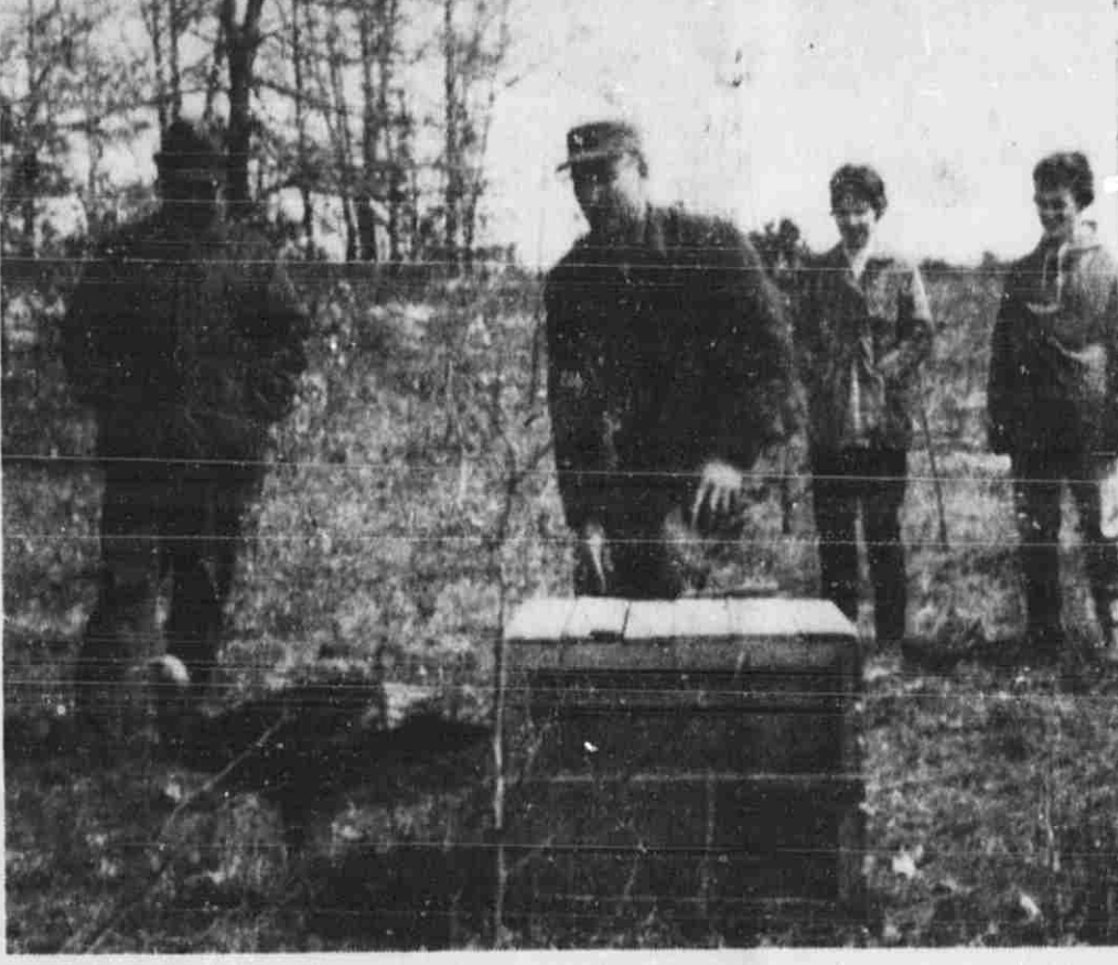
Release wild turkeys near Lowell

Trophies For The Show Donated By Lowell Car Dealers and Merchants