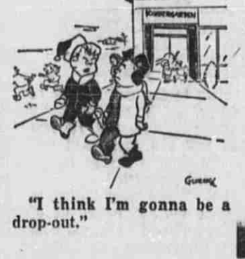
"I think I'm gonna be a drop-out."