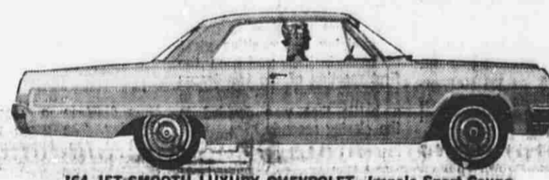
'64 JET-SMOOTH LUXURY CHEVROLET—Impala Sport Coupe

CUPID APPROVED BALL Floral Shop 517 E. Main St., Lowell Phone TW 7-1150