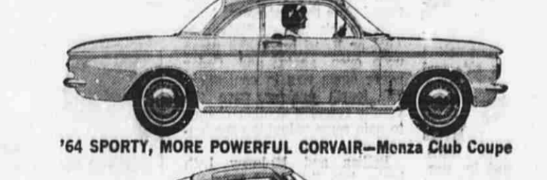
'64 SPORTY, MORE POWERFUL CORVAIR—Monza Club Coupe