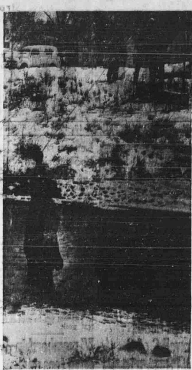
WORLD'S COLDEST JOB —A Michigan Highway Department employee wades into the chilly waters of the Rocky River at Three Rivers to complete surveying for a State Highway Department widening project scheduled to be done later this year.