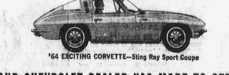
'64 EXCITING CORVETTE—Sting Ray Sport Coupe

YOUR CHEVROLET DEALER HAS MORE TO OFFER: luxury cars, thrifty cars, sport cars, sporty cars, big cars, small cars, long cars, short cars, family cars, personal cars 45 DIFFERENT MODELS OF CARS Why one stop at your Chevrolet dealer's is like having your own private auto show And if we had room here we could go on and list all the engines Chevrolet offers, ranging up to an extra-cost 425-hp V8 in the big Chevrolet. And all the different transmissions. And the upmost different exterior and interior color choices. And the models with bucket seats and those without. And the hundreds of different accessories, including the new extra-cost AM-FM radio. But that's best left to your Chevrolet dealer. That and exactly how reasonable the price can be for you to be able to enjoy so much car.