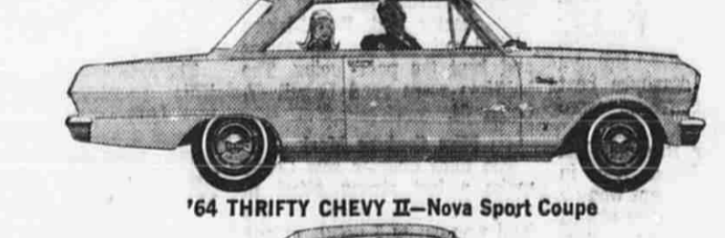
'64 THRIFTY CHEVY II—Nova Sport Coupe