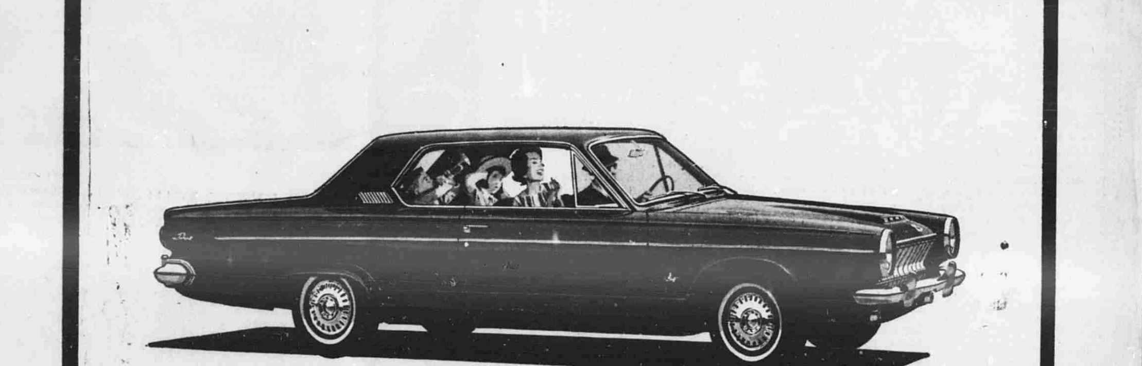
1963 DODGE DART... A FRESH NEW COMPACT IN THE LARGE ECONOMY SIZE