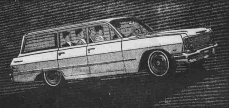
'63 CHEVROLET BEL AIR STATION WAGON