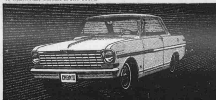
'63 CHEVY II NOVA 400 SPORT COUPE