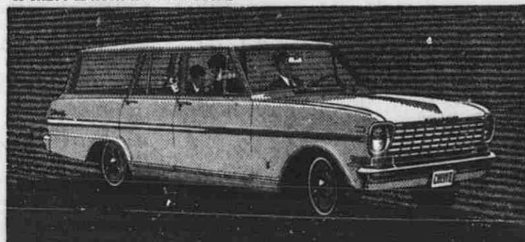
'63 CHEVY II NOVA 400 STATION WAGON