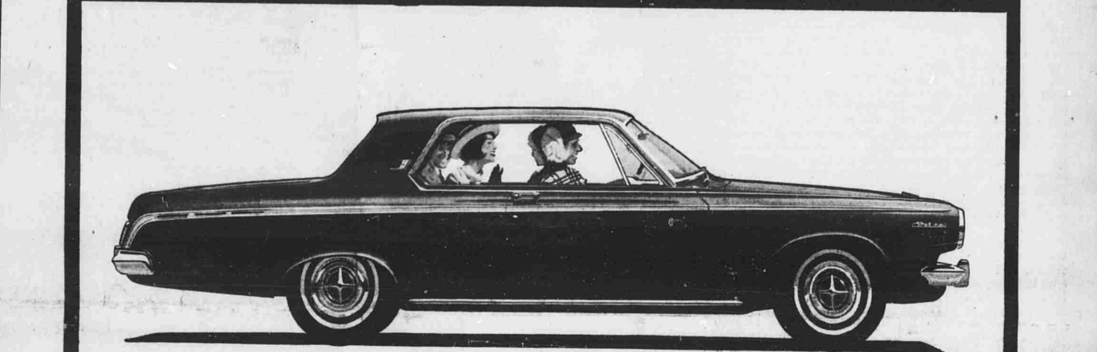
1963 DODGE... BEAUTIFUL NEW ENTRY IN THE LOW-PRICE FIELD