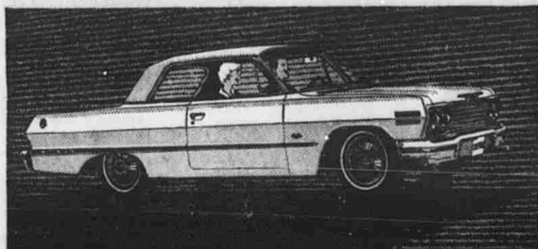
'63 CHEVROLET IMPALA SPORT COUPE