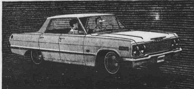
'63 CHEVROLET IMPALA SPORT SEDAN

Ligouri Nugent, Clerk Grattan Township AT HOME Five Mile Road, N. E.