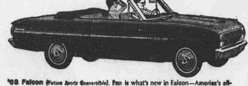
'63 Falcon (Futura Sports Convertible). Fun is what's new in Falcon—America's all-time economy champ. 15 cars and wagons including the first Falcon Convertible—with power-operated top, 170 Special Six (standard). Now all '63 Falcons* have Ford's exclusive TWB-2 car service-saving features. *Except Falcon Station Bus and Club Wagon.

*'63 super torque Ford Galaxie (foreground: Galaxie 500/M 2-Door Hardtop). The look, the power—and now the feel of the fabulous Thunderbird! A ride so Thunderbird-smooth, you must try it to believe it! Super torque thrust up to 405 hp (optional). *'63 Ford Fairlane Hardtop (background: Fairlane 500 Sports Coupé). Hot new middleweight... with V-8 punch! A full line of nine Fairlanes! Three new middleweight wagons. Two new hardtops. Four sedans. Big-car room, ride, performance... nimble new size... saving prices. New optional 260 V-8... 321 V-8 for standard Sid.