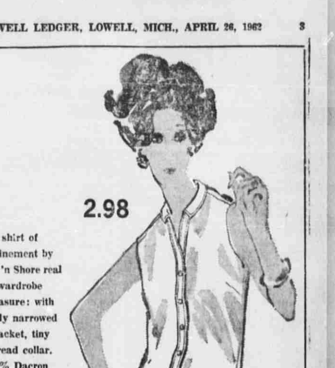
95% Dacron polyester, 5% cotton, white, shirt with refined placket, wrap collar.

RESIDENTIAL COMMERCIAL INDUSTRIAL 218 WEST MAIN ST., LOWELL PHONE TW-7577