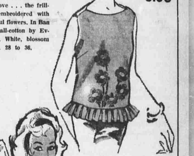
fancy floral blouse in Blue-Care all-cotton by Everlast. White, blossom colors, $8 to $6.