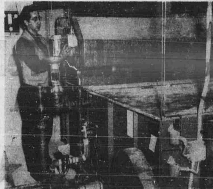
Air Handling Unit for Cooling and Ventilating