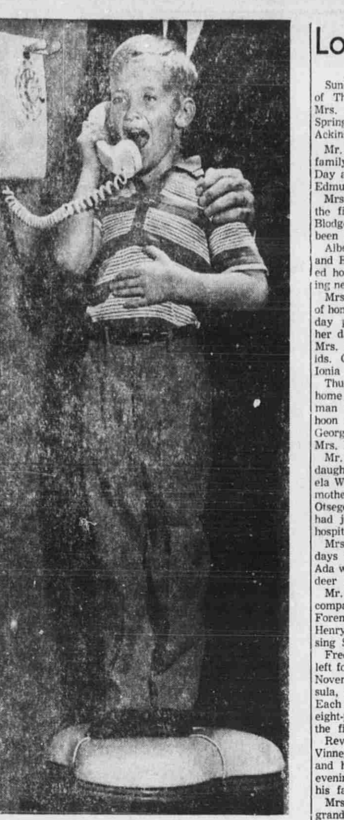
"I had a drunstick 'n cranberries 'n mince pie 'n everything!" When your whole family can't be together Thanksgiving Day, pick up your telephone. In seconds you're sharing Thanksgiving with those you love.