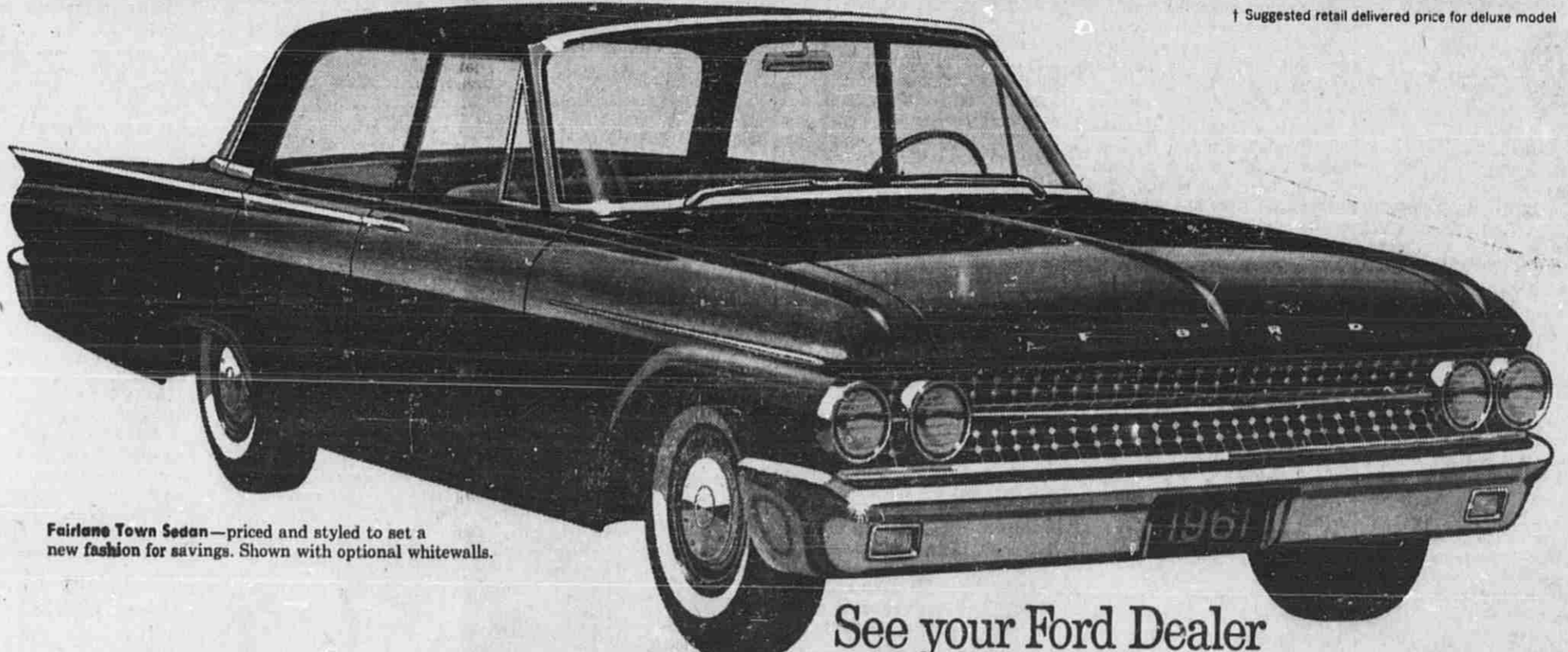
Fairlane Town Sedan—priced and styled to set a new fashion for savings. Shown with optional whitewalls.