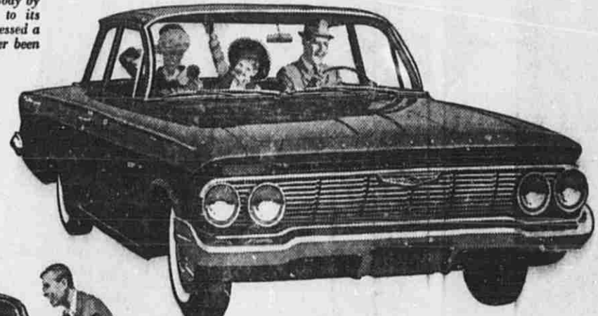
Biscayne 2-Door Sedan. That solid Body by Fisher greatly shaped clear back to its classic leading trunk. (The floor's recessed a full 7" to hold things that have never been inside a trunk before!)

MEASURABLY NEW, IMMEASURABLY NICE! '61 CHEVY Open the door to a whole new measure of your money's worth! There's more entrance space in this '61 to make getting in and out easier. More rear foot room for the man in the middle. Seats that are as much as 1 1/2" higher—just right for sitting, just right for seeing. A tremendously spacious new kind of deep-well trunk that opens at bumper level for easy, short-lift loading. But look—there's actually less outer space, leaving extra inches of clearance for parking and maneuvering! Neat trick? Bless our ingenious designers and engineers. They've shaped spacious dimensions, proved performance, thrift and dependability into the most sensationally sensible car you could buy. It's waiting for you at your Chevrolet dealer's right now.