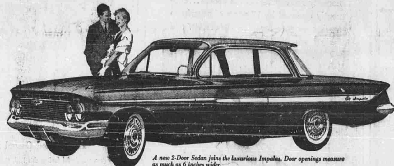
A new 2-Door Sedan joins the luxurious Impalas. Door openings measure as much as 6 inches wider.

MEASURABLY NEW, IMMEASURABLY NICE! '61 CHEVY Open the door to a whole new measure of your money's worth! There's more entrance space in this '61 to make getting in and out easier. More rear foot room for the man in the middle. Seats that are as much as 1 1/2" higher—just right for sitting, just right for seeing. A tremendously spacious new kind of deep-well trunk that opens at bumper level for easy, short-lift loading. But look—there's actually less outer space, leaving extra inches of clearance for parking and maneuvering! Neat trick? Bless our ingenious designers and engineers. They've shaped spacious dimensions, proved performance, thrift and dependability into the most sensationally sensible car you could buy. It's waiting for you at your Chevrolet dealer's right now.