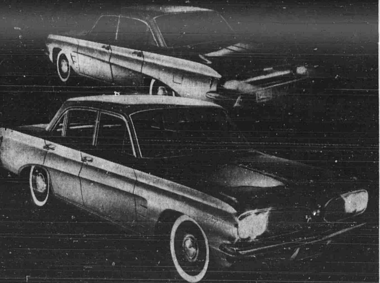
WITH 4-BARREL CARBURETOR AND AUTOMATIC TRANSMISSION, EXTRA-COST OPTIONS

THE NEW TEMPEST IS ON DISPLAY TODAY AT YOUR LOCAL AUTHORIZED PONTIAC DEALERSHIP