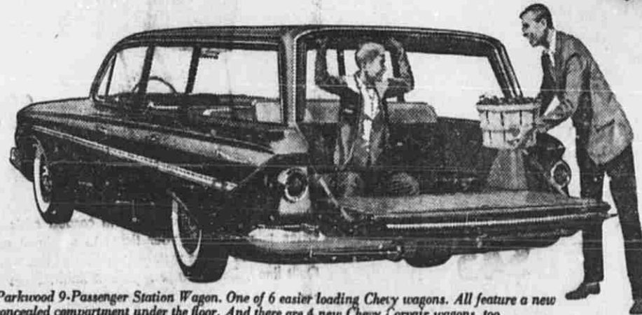
Parkwood 9-Passenger Station Wagon. One of 6 easier loading Chevy wagons. All feature a new concealed compartment under the floor. And there are 4 new Chevy Corvairs wagons, too.

See the new Chevrolet cars, Chevy Corvairs, and the new Corvette at your local authorized Chevrolet dealer's AZZARELLO CHEVROLET & BUICK, INC.