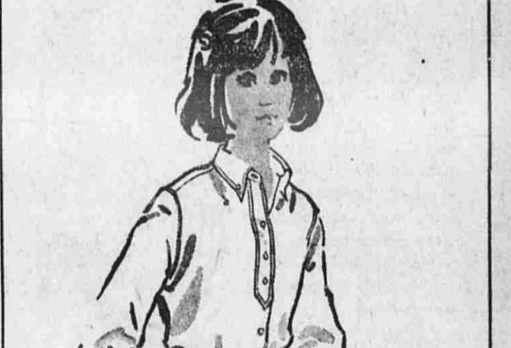
LOUISA ALCOTT fashions rich jewel tones of printed Celanese Magic Crepe in an exotic far east design. Party perfect - every perfect for the gay Holiday Season, emerald, sapphire, topaz-brown. Sizes 10 to 18

Ship's Shore's no-iron oxford shirt Always on best behavior! It's the button-down shirt, in carefree cotton oxford that stays fresh all day. So grow-up... with smart denim-pleated, back-pleat, long tails that keep her looking neat. Just dip in studs... drip-dry! White, pastels. See all our easy-care Ship's Shores for girls!