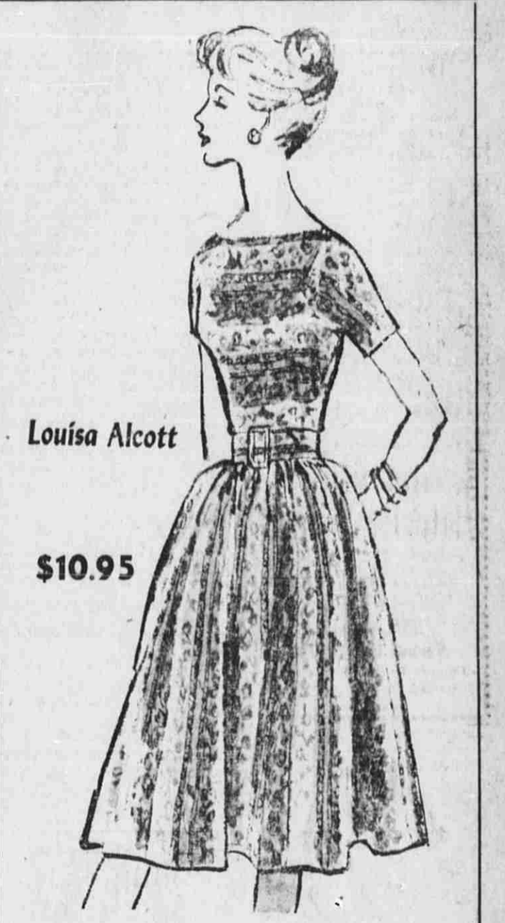
LOUISA ALCOTT fashions rich jewel tones of printed Celanese Magic Crepe in an exotic far east design. Party perfect - every perfect for the gay Holiday Season, emerald, sapphire, topaz-brown. Sizes 10 to 18