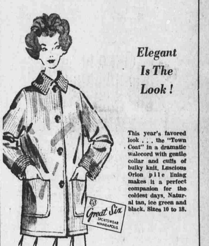
Elegant Is The Look!