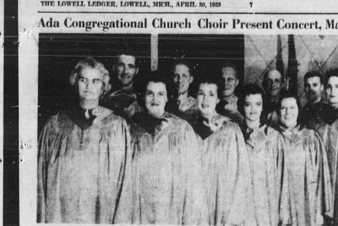
The choir of the First Congregational Church of Ada will present a concert Sunday evening, May 3, at 8 p. m.