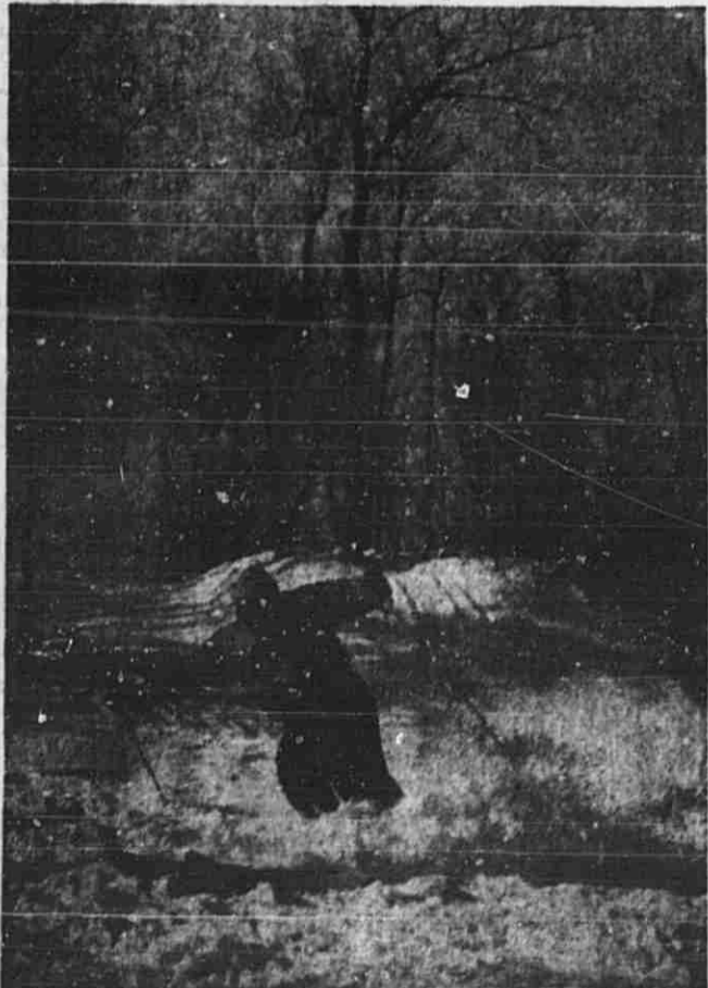
Scenes like this are being repeated daily on slopes and hills throughout Michigan's Winter Wonderland. Thousands of enthusiastic skiers invade the state's 65 skiing areas each year. State supervised areas, equipped with ski tows and other special facilities, are found at Holly, Highland and Pinckney recreation areas and Porcupine Mountains state park.