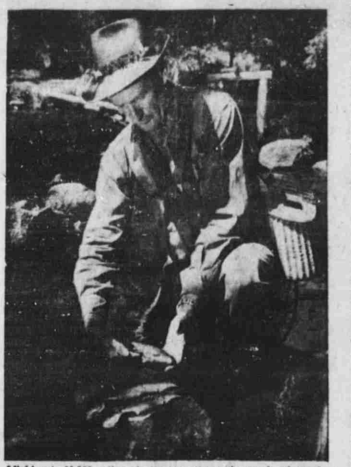
Michigan's 26,000 miles of streams attract thousands of trout fishermen who claim this sport is tops in outdoor enjoyment. Trout angling continues to grow in popularity and more than 225,000 trout fishermen are expected to test their skills during the state's April 28-September 14 season this year.

CARD OF THANKS If you have plans for tomorrow, be careful today—DRIVE SAFELY.