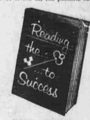
NATIONAL LIBRARY WEEK March 16-22, 1958

At the annual meeting last Thurs- novel of the all too possible future. day of the Lowell Board of Trade,