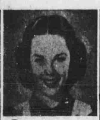
Patsy says: Extra Savings With Coall

Patsy Stoker-over 97% pure—burns longer, gives clean, at e a dy heat. More coal per ton—all impurities removed. And you remove the clinker half as often. Patay Stoker is a real good Re-order Today-Try Patsy