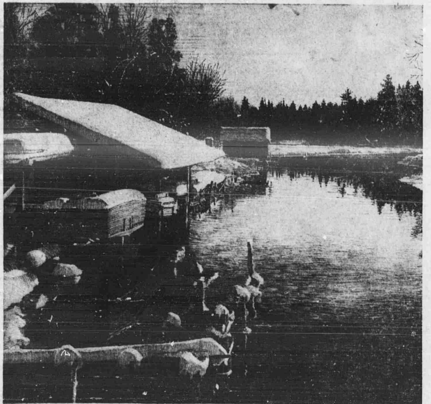
WINTER SCENE IN NORTHERN MICHIGAN