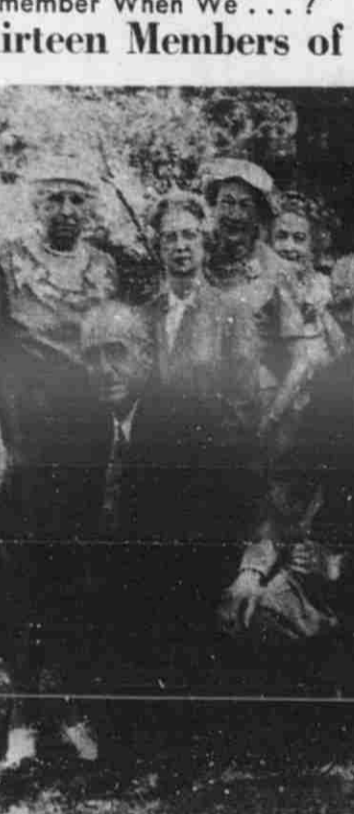
Thirteen members of the Lowell High School Class of 1907 were on hand last Saturday, with their wives and husbands, to reminisce about the good old days, and get 'caught up' on the events in their lives since they attended school here.

Thirteen members of the Lowell High School Class of 1907 were on hand last Saturday, with their wives and husbands, to reminisce about the good old days, and get "caught up" on the events in their lives since they attended school here.