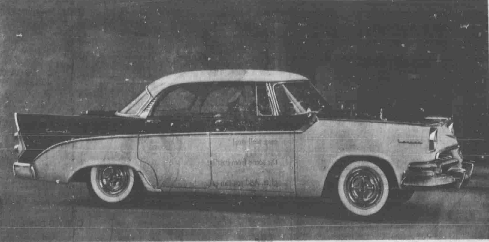
Coronet 4-door Lancer