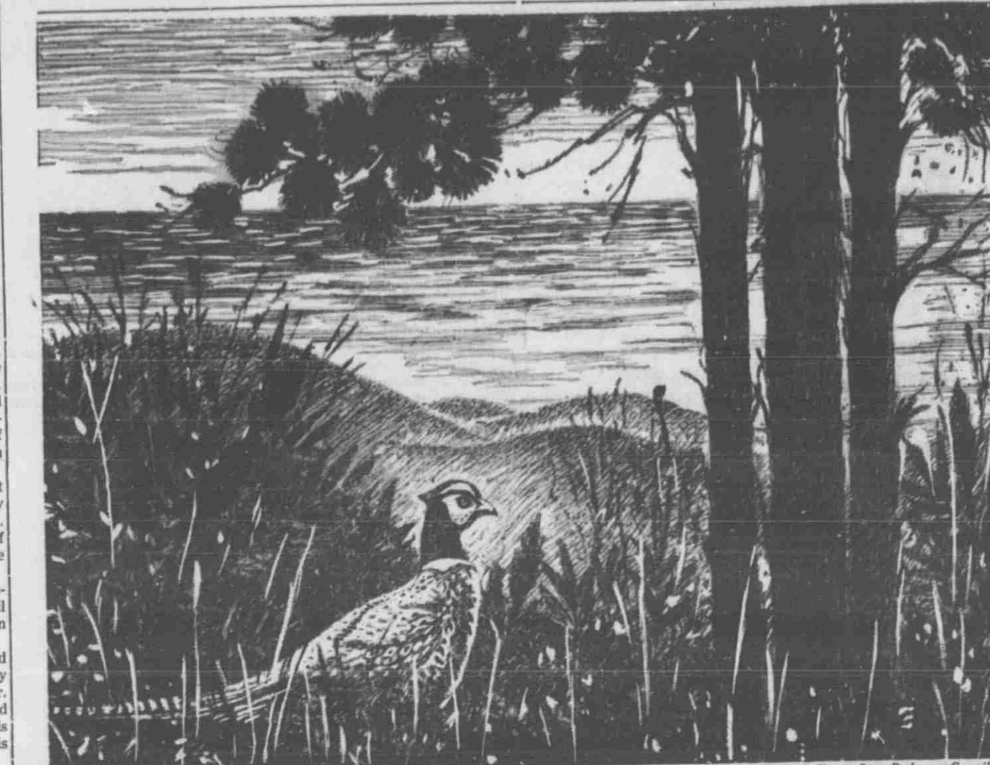
Scenic in Sleeping State Park near Gaultville