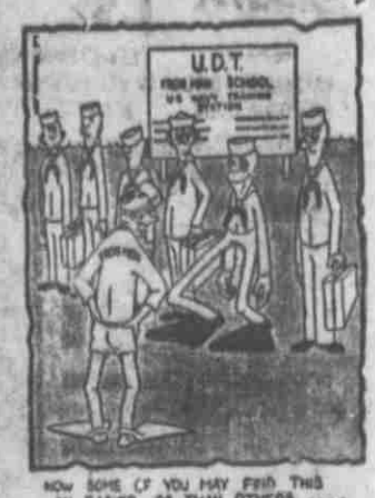
Now some of you may find this an easier job than others...

The ROLLINS Agency 635 W. Main Phone 9325