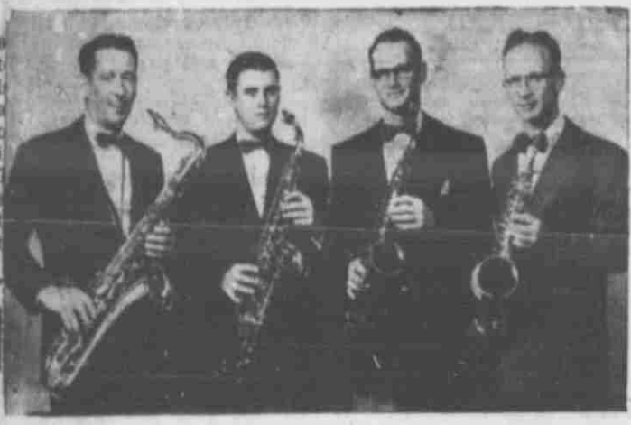
A fine musical program will be featured at this week's Snow Methodist Drive-in service. Three young ladies will sing and a saxophone quartet will perform their arrangements of gospel music.