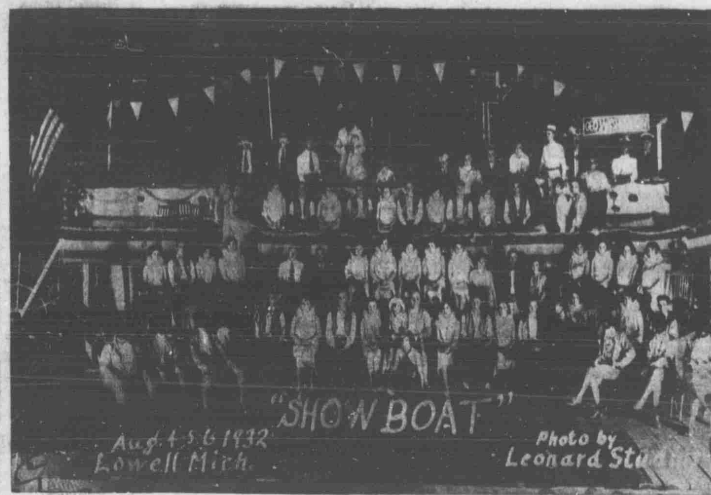
The George Washington I made her proud maiden voyage on August 4, 1932, to start a ball rolling which grew and grew to the fine showboat program we will see on July 25 on Flat River. The above picture of the first Showboat cast and chorus will bring back a little nostalgia to those who took part, or who viewed this show.