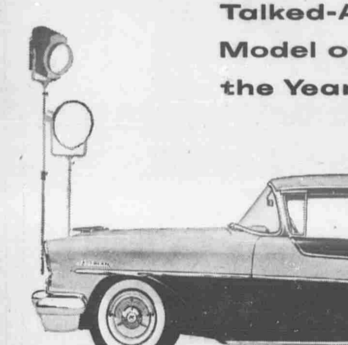
Ninety-Eight Deluxe Holiday Sedan.

the only 4-door hardtop in the finest car field!