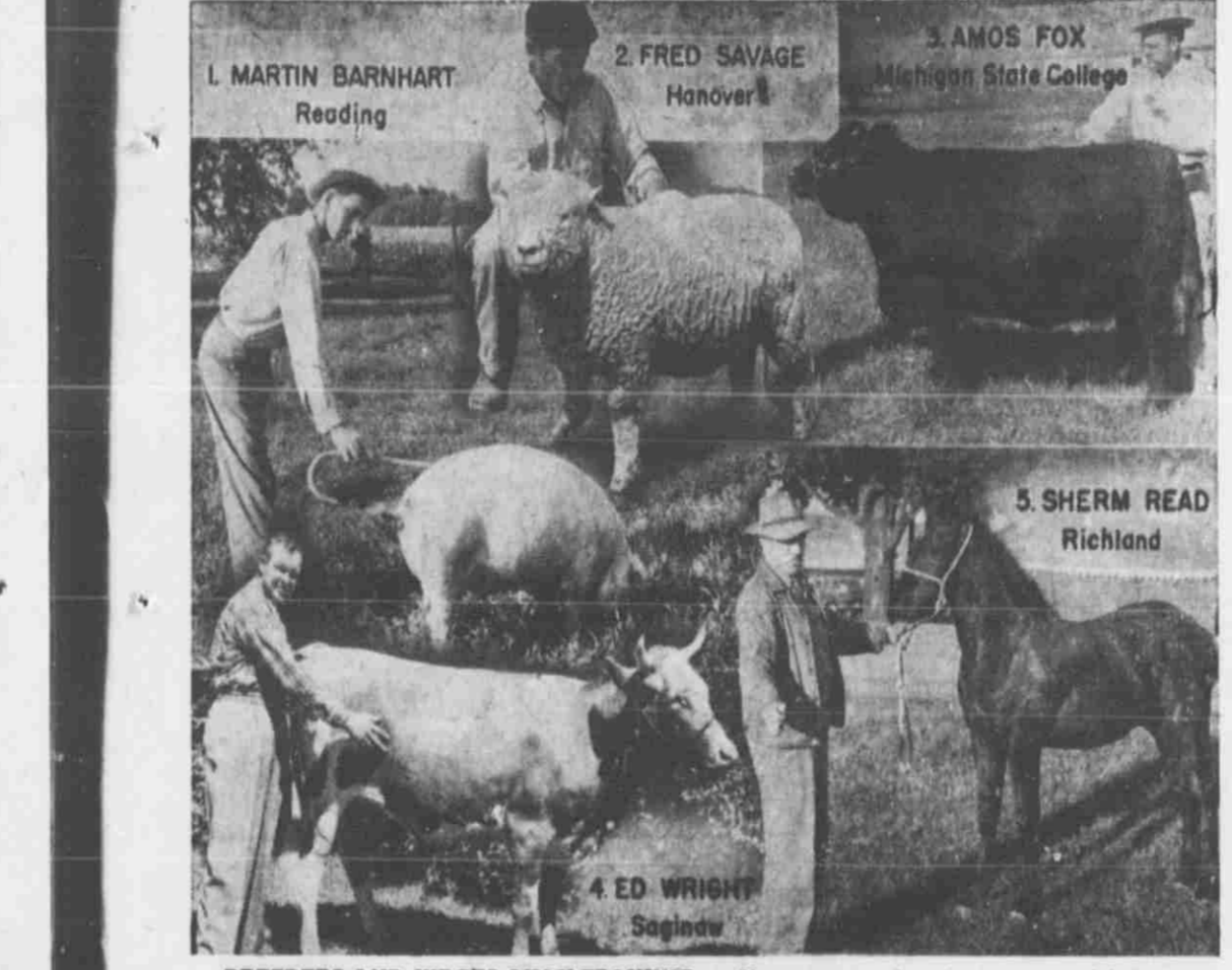
BREEDERS AND JUDGES OKAY TRAINING - Young men who aim at successful farming, livestock breeding and agricultural leadership will benefit from Michigan State College agricultural short courses...