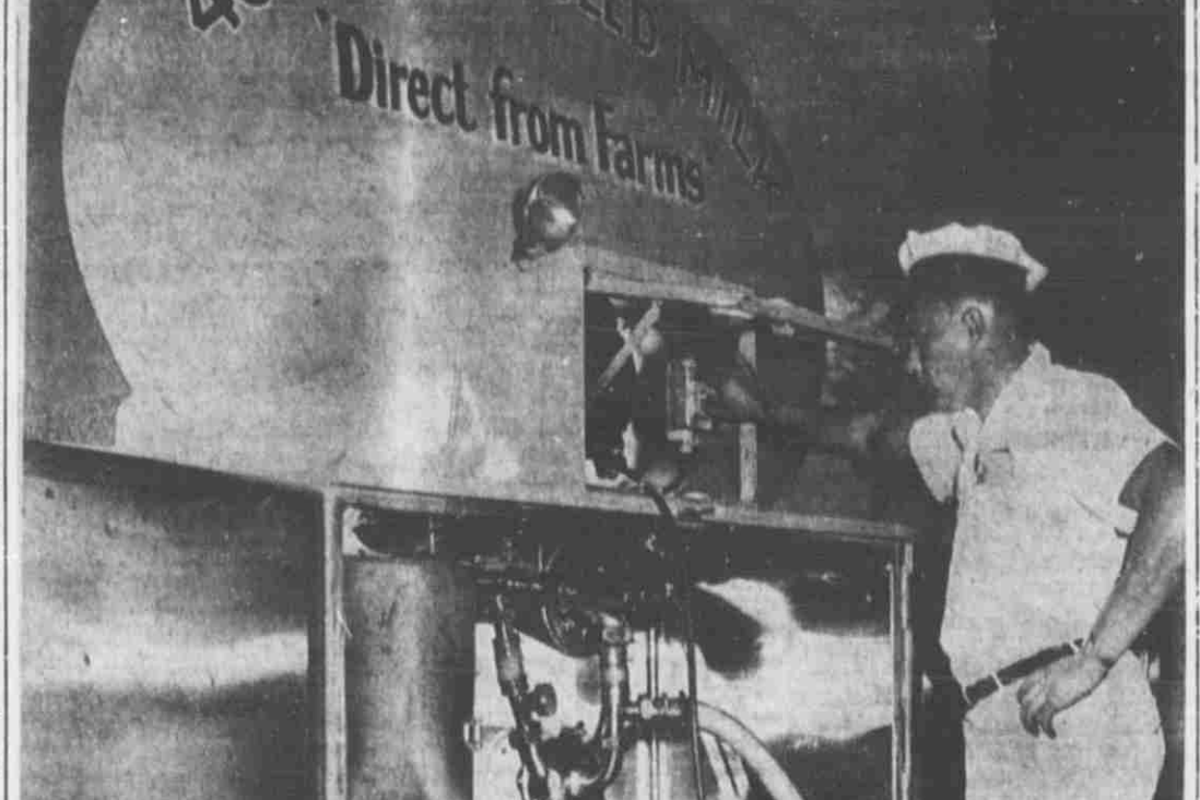
400-gallon stainless steel tank truck at the plant in Lowell, Mich., is used to haul milk from the Thomas-Cook farm.