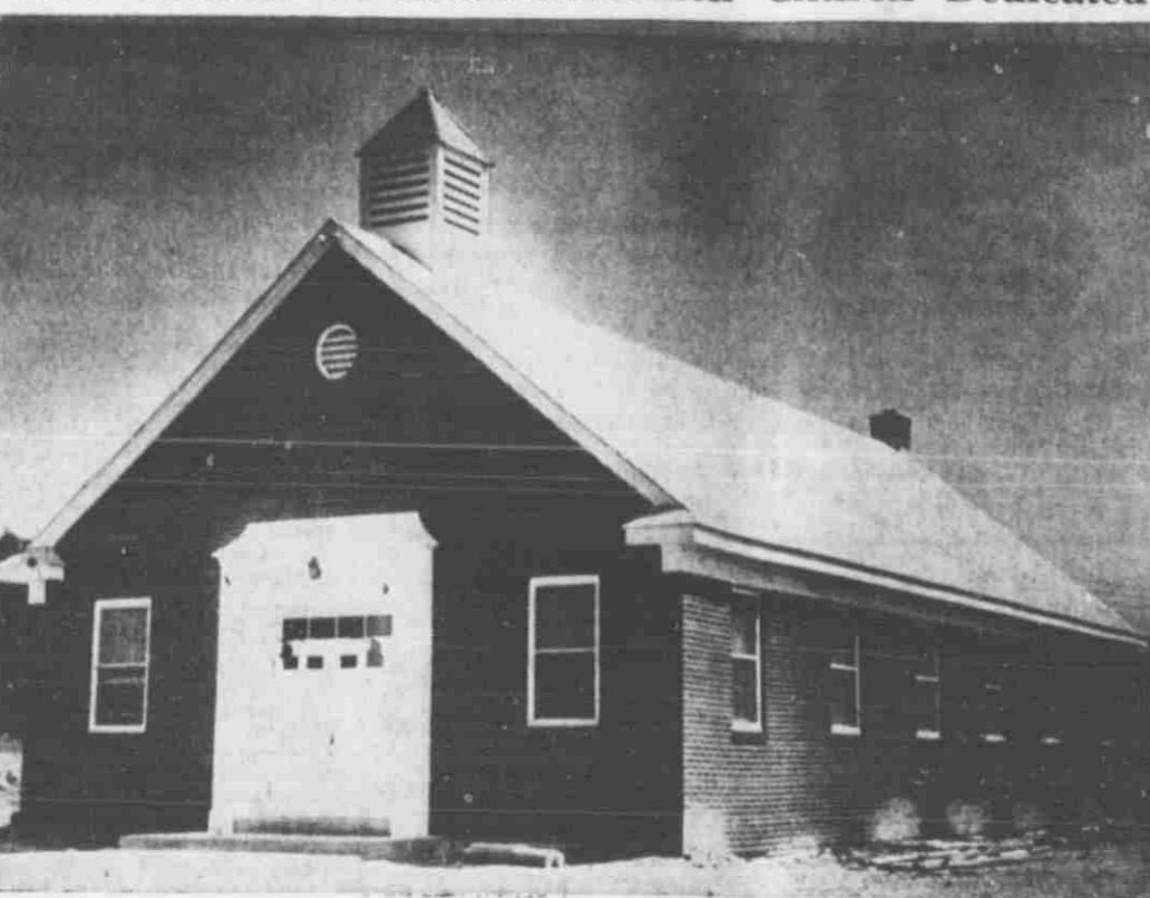
Dedication services for the newly-completed Cascade Christian Reformed church, Cascade Ave., were held in the auditorium of the building Tuesday evening at 8 o'clock, with three clergymen officiating.