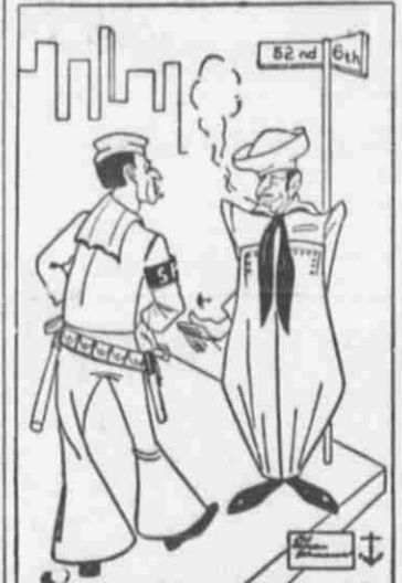
Bill right, Gilbert on it's sharp, but you're still out of uniform!

On well-drained land free from danger of serious erosion, corn can produce more total livestock feed an acre than any other common feed crop.