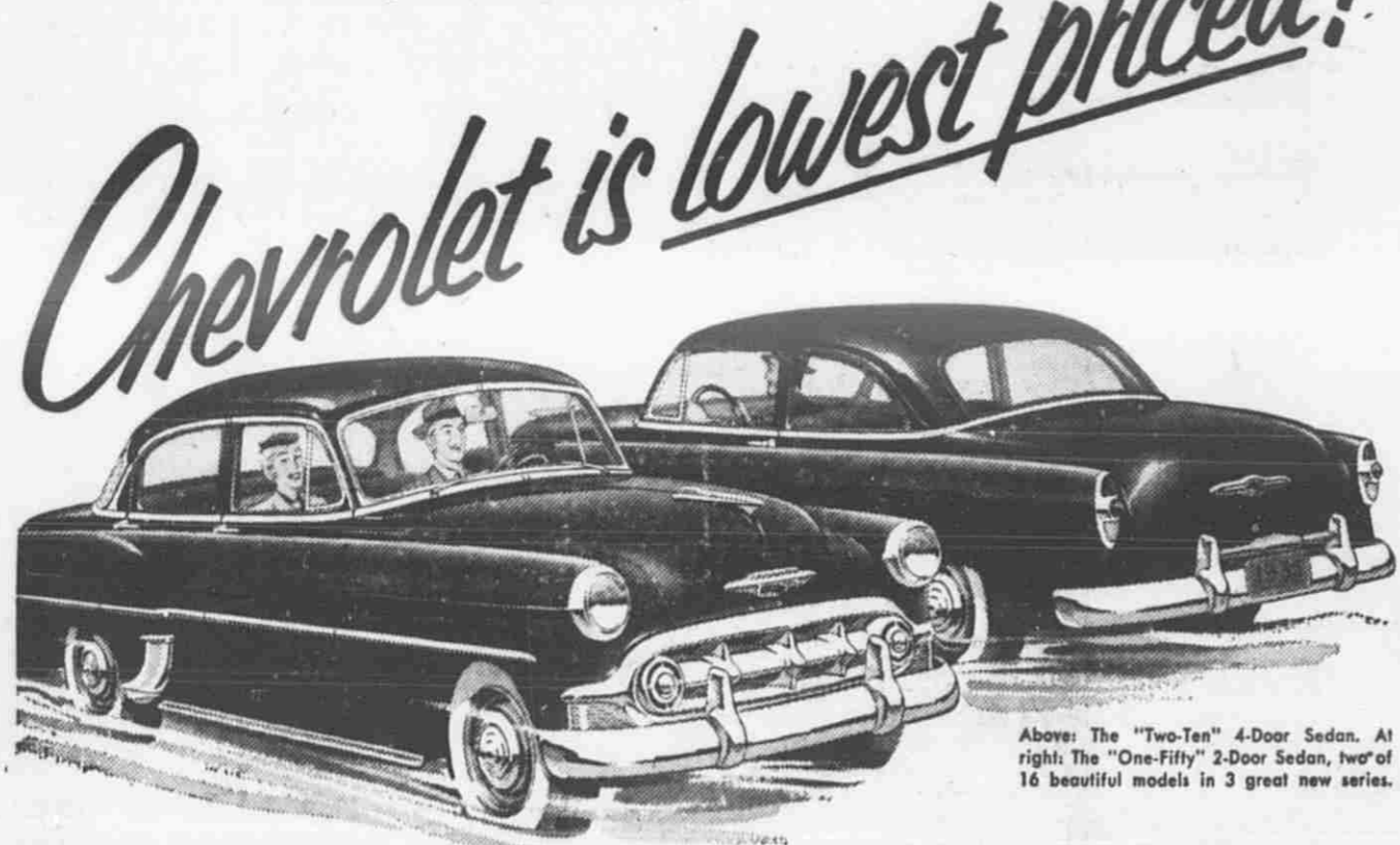
Above: The "Two-Ten" 4-Door Sedan. At right: The "One-Fifty" 2-Door Sedan, two of 16 beautiful models in 3 great new series.

It brings you more new features, more fine-car advantages, more real quality for your money . . . and it's America's lowest-priced full-size car!