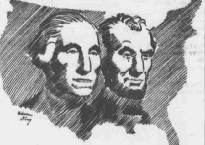
Almighty God, we make our earnest prayer that Thou wilt keep the United States in Thy holy protection. -George Washington