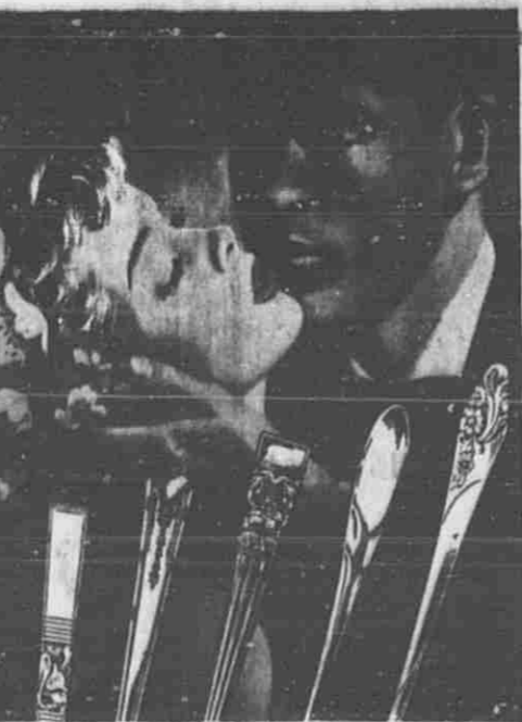
Morning Star® Milady® Coronation® Lady Hamilton® Evening Star® *Trade-Marks of Oxide Ltd.