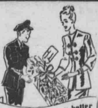
FLOWERS say it better

A heavy coating of wax will help protect table tops from unsightly watermarks.