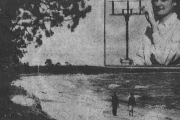
A stretch of sandy Lake Huron beach between Chebeyan and Alpena is one of many Michigan areas found to enjoy an atmosphere soothing to hay fever-sufferers.