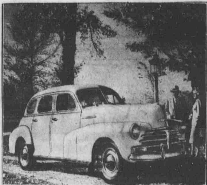
The over-all simplicity and massiveness of the new, 1948 Chevrolet is well shown in this three-quarter view of the Fleetmaster Sport Sedan. Fenders, hood, body and door panels all blend; and the crease moulding, below the windows, is wider than that used in previous models. Note the new T-shaped chrome center bar on the radiator grille.