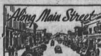
Along Main Street