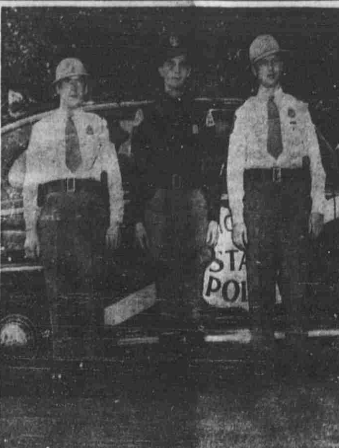
STATE POLICE DON NEW TIGS