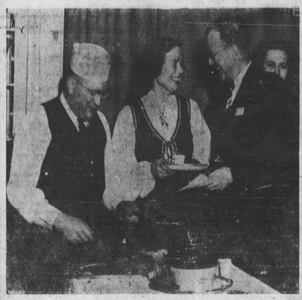
A feature of the 7th annual convention of the Michigan Press Association...