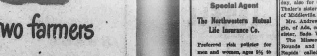
One time there were two farmers

Around Christmas they met again. "Say, Jake grinned," you oughta try my system. Got the nag eaten' half sawdust an' half grain now. It's a lot cheaper."