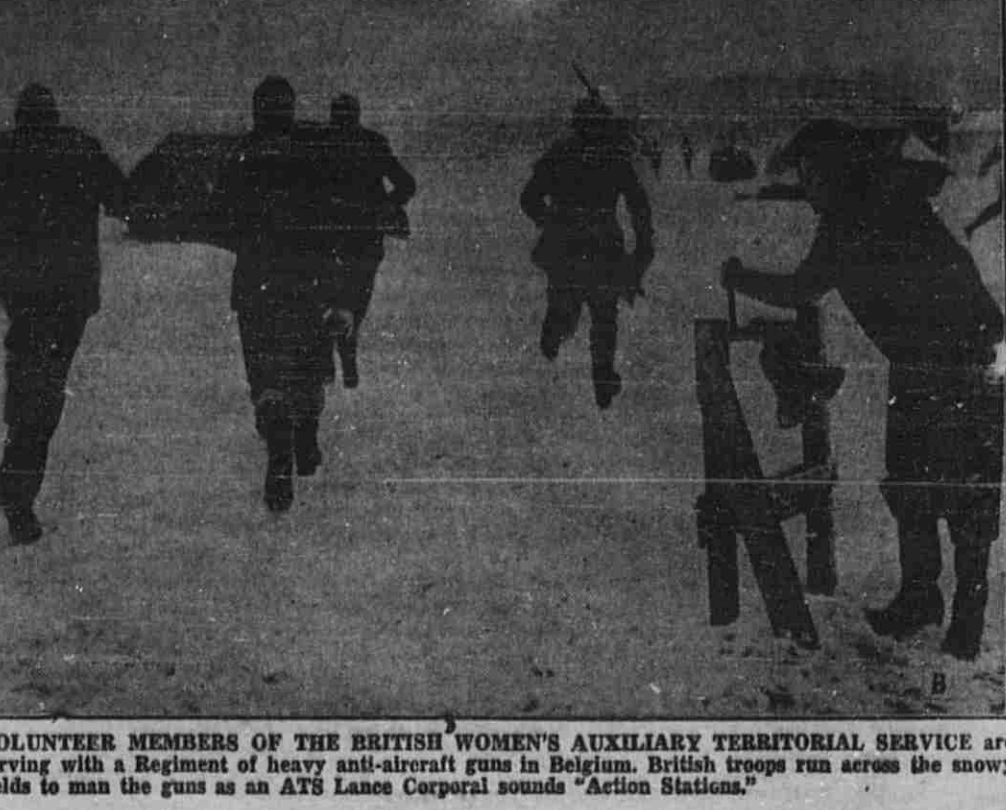
Volunteer members of the British Women's Auxiliary Territorial Service are seen in uniform.

In the County of Kent. In a session of said Court held at the Probate Office in the City of Grand Rapids on the 8th day of March 21, 1946.