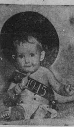
This charming young daughter of a marine corporal is all set to welcome the advent of 1945.