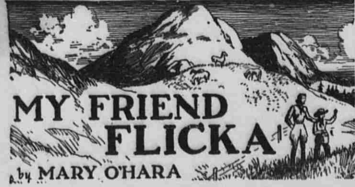
MY FRIEND FLICKA by MARY OHARA

CHAPTER XVII At dinner, Ken ate nothing. How said, "Ken isn't eating his dinner—doesn't he have to eat, Mother?"