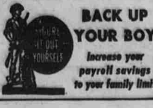
BACK UP YOUR BOY. Increase your payroll savings to your family limit.