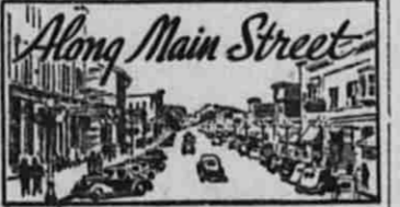
Shoppers are again reminded that Lowell stores will be closed all day Saturday on account of Memorial Day. Stores will be open Friday night for the accommodation of the public.