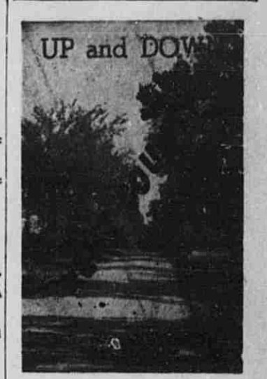
By K. K. Vining

lighthouse will carry its message 22, commencing at 1 o'clock. List ber articles. An intensive effort is includes piano, new refrigerator, being made now to start rubber new washing machine, etc. Terms, plantations in this hemisphere.